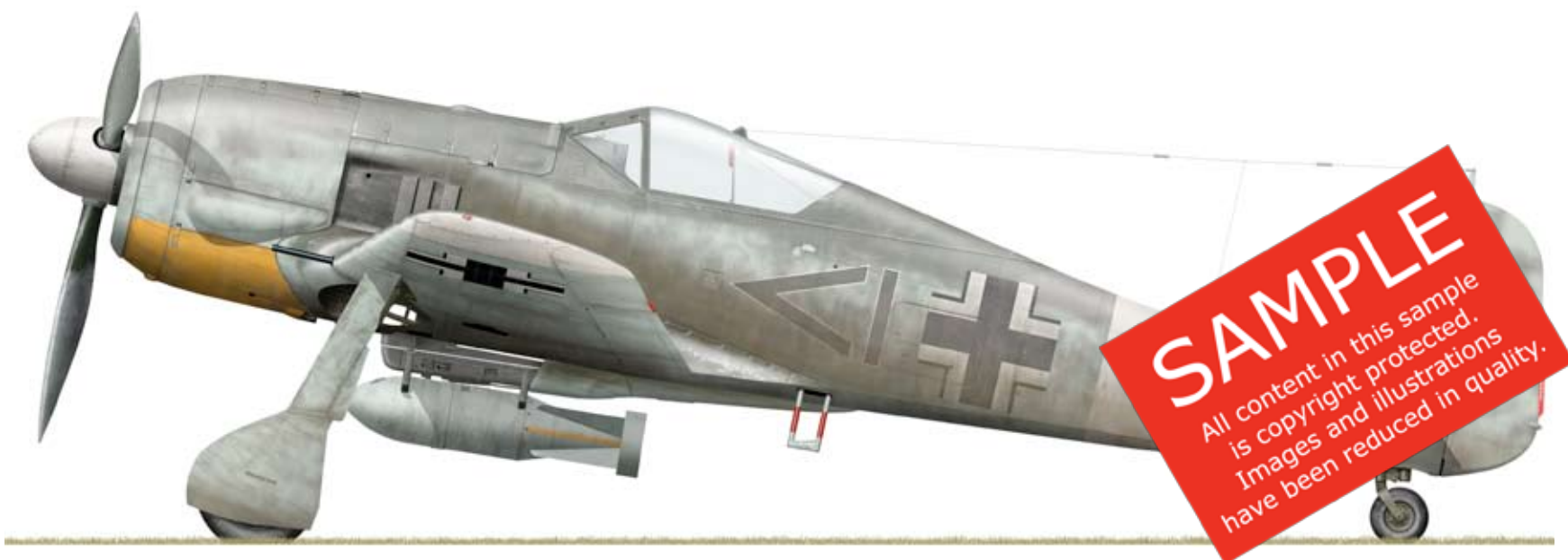
Below: Fw 190 A-5 ' < l + ' of Sch.G. 2, Brindisi, May 1943.

SAMPLE All content in this sample is copyright protected. Images and illustrations have been reduced in quality.