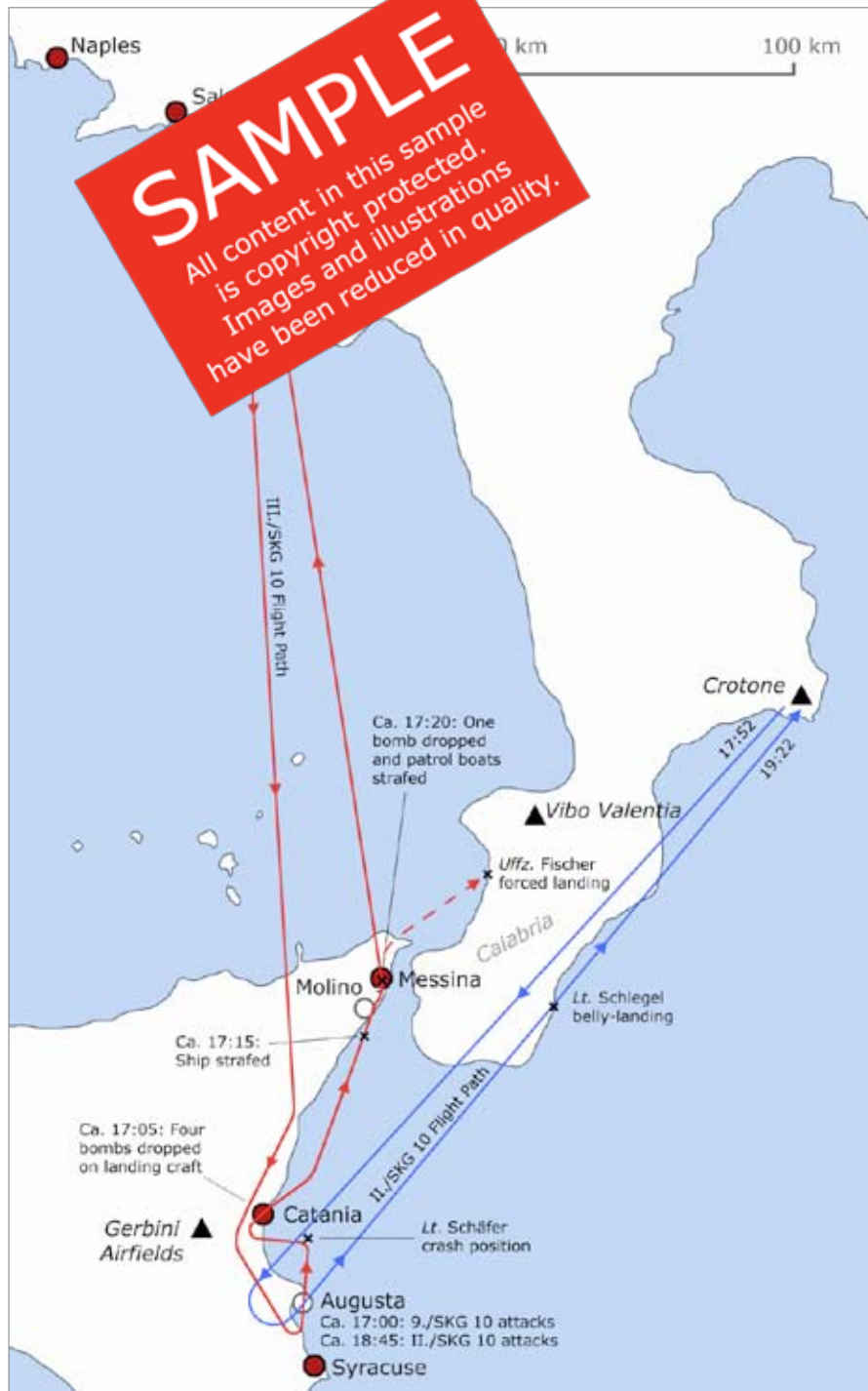
Above: 29 August mission map.