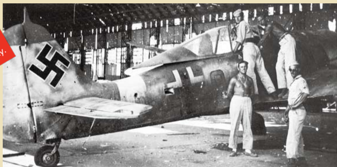
Top: Crashed Fw 190 A-4 W.Nr 0142 409 'Black 2 + <-' of 10.(Jabo)/JG 26, which was shot down over England on 20 January 1943. This aircraft had the top of its tail painted yellow. The pilot, Lt. Hermann Hoch, was taken prisoner.